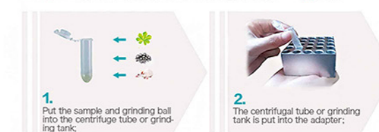
1. Put the sample and grinding ball into the centrifuge tube or grinding tank.

LAWSON: Easy to complete sample processing, as long as 4 steps: