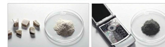
▲ Before and after bone grinding with LAWSON grinding apparatus

The excellent grinding effect of LAWSON grinding instrument