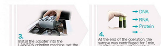
3. Install the adapter into the LAWSON grinding machine, set the operating parameters, start the device;